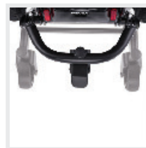
Single or double support castor for stability