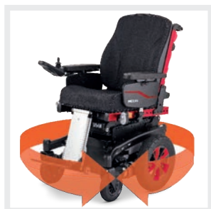
Manoeuvre around obstacles or turn on the spot