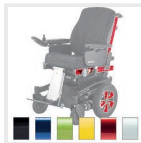
A choice of colours with accents to personalise your powerchair